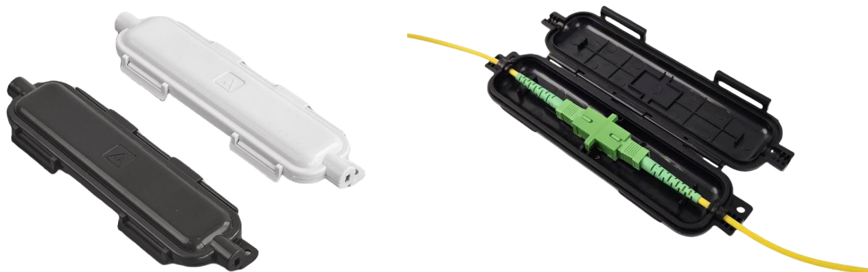
Suitable for 1 SC Adapter